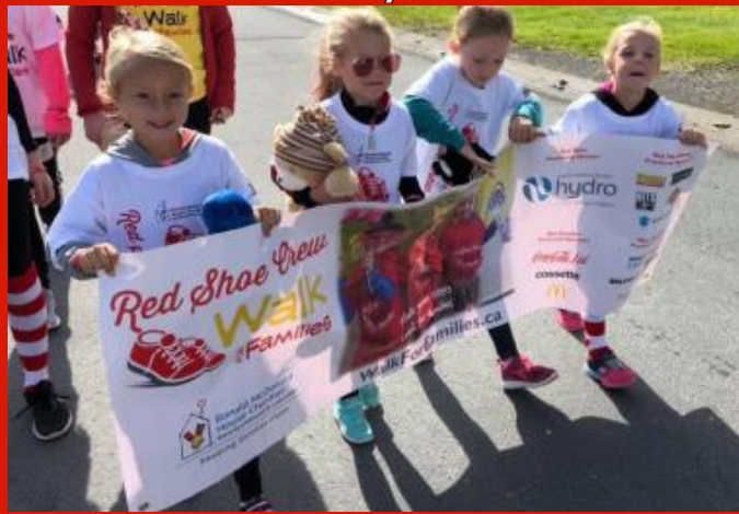
Red Shoe Crew-Walk for Families held annually in September