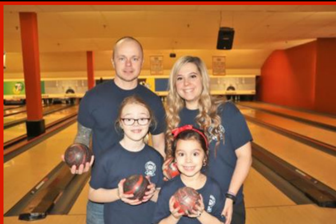
SPARE Some Love Bowling Event held annually in March