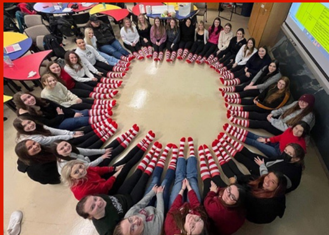
SockIT for Sick Kids and their Families held annually in November